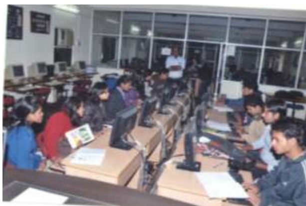
Computer Science Laboratory