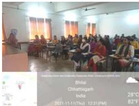
Seminar Hall Seating space