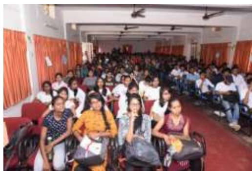
Conference Hall Seating space