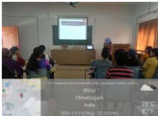
Seminar Hall with ICT Facility