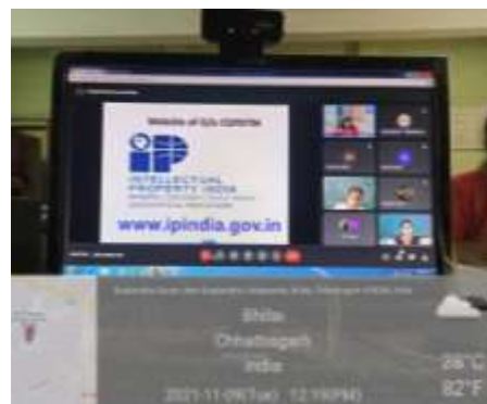
Classroom Computer with ICT Facility