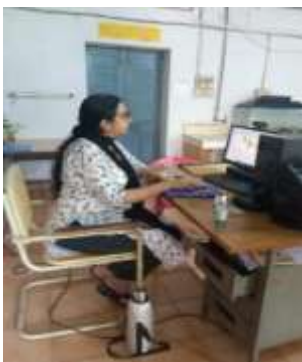
Classroom with Computer equipped with WI-FI, Camera, Speaker and LMS facility