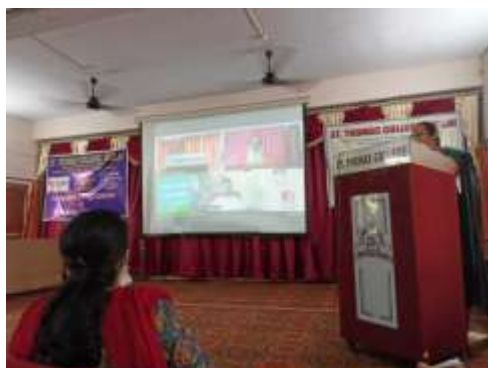
Conference Hall with ICT Facility