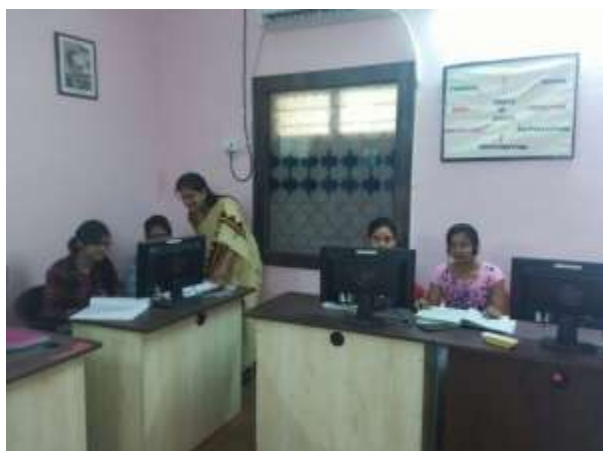
English Language Lab