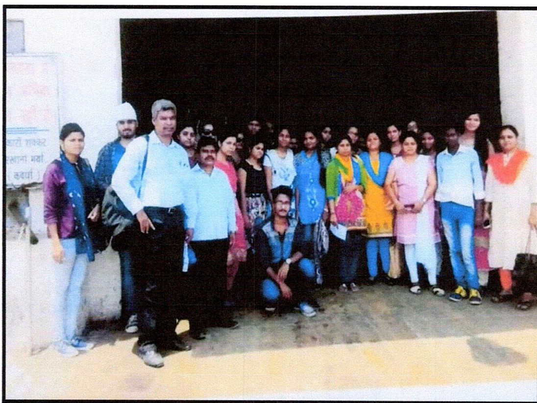
PRINCIPAL ST. THOMAS COLLEGE, BHILAI RIJABANDHA, BHILAI (C.G.)

M.Sc Students visited the Sugar Factory on 15 February 2017. The aim of the visit was to get the knowledge of Biggest Co-operative Society of Chhattisgarh and to understand the various processing units.