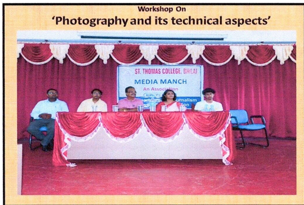
PRINCIPAL ST. THOMAS COLLEGE, BHILAI RUABANDHA, BHILAI (C.G.)